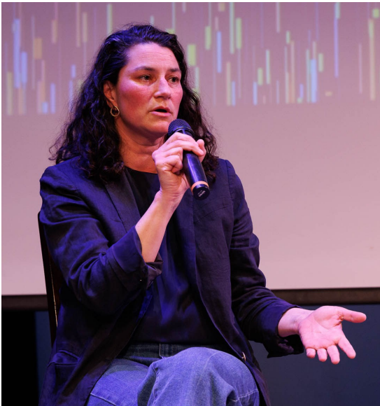
Senator Emily Alvarado