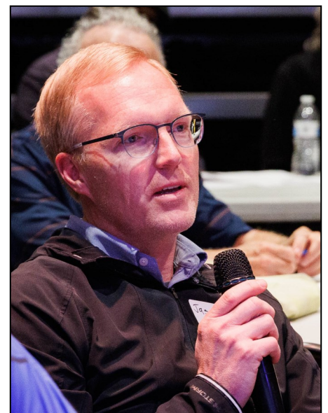
A member offers a suggestion on how to use our influence in other areas in the state.