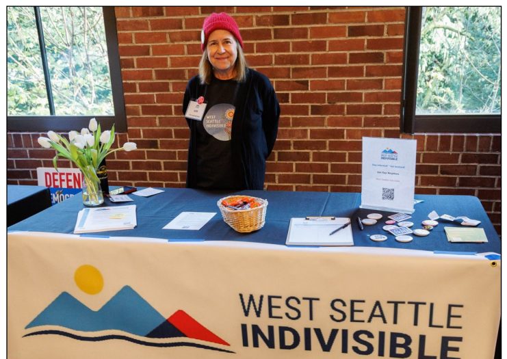
A volunteer from West Seattle Indivisible at the Joiners Jamboree before our April meeting.

The Heron's Nest was "created for the benefit of the Duwamish Tribe and the broader community, we teach and practice traditional ecological restoration, urban agriculture, and skills sharing — offering a retreat within the city of