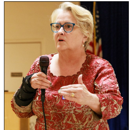
Seattle School Director for D6 speaks of the issues the district faces.