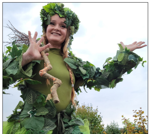
A denizen of the Duwamish River Peoples Park.