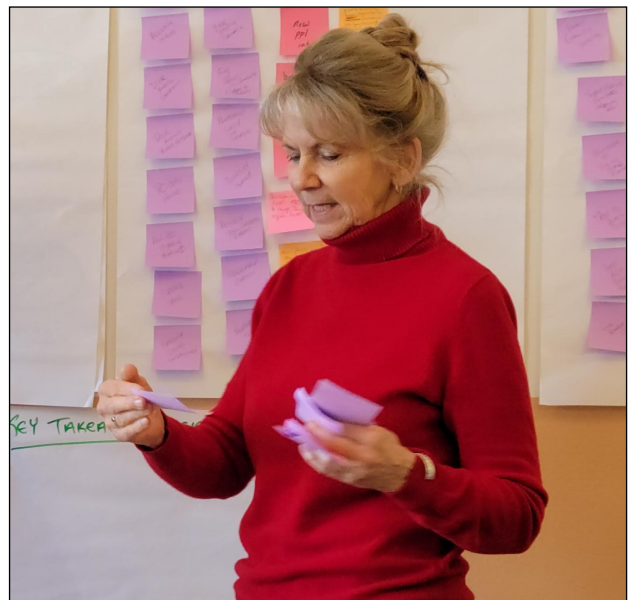
State Committee person posts "spitball" suggestions at the Executive Board Strategy and Ideation Session March 18th.