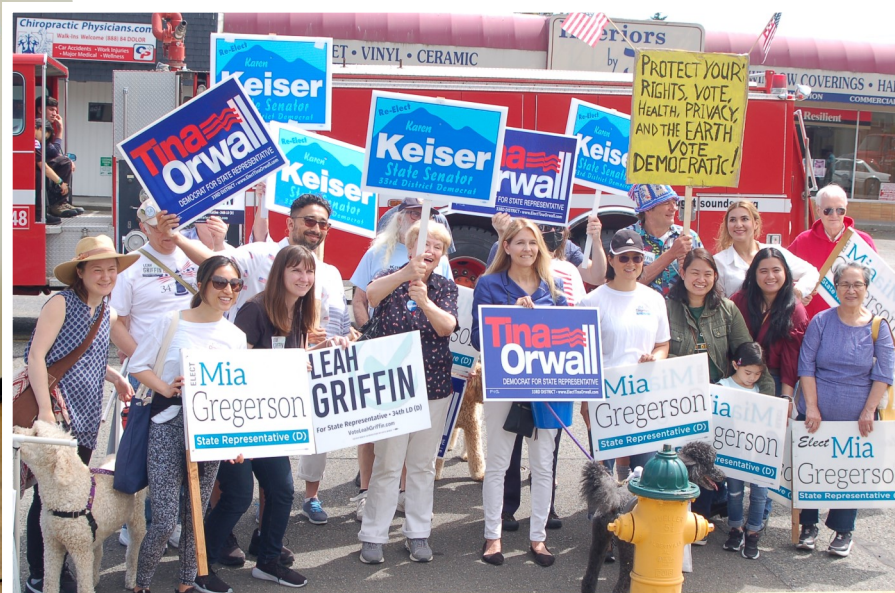
Top: Our Burien Independence Day Parade unit was swarmed by members of the 33rd LD...including all of their Olympia Delegation.