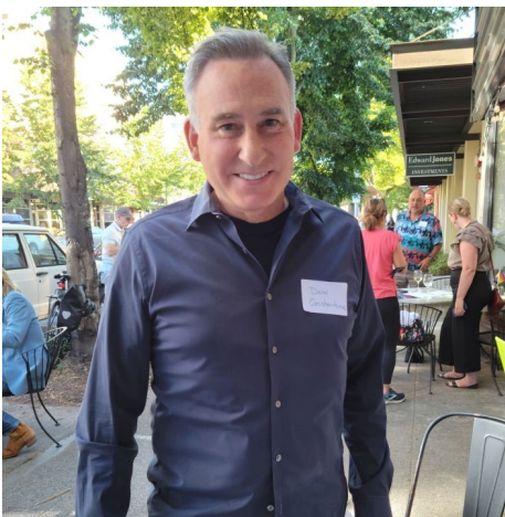
KC Exec Dow Constantine signs in, anxious to make his pitch for donations!