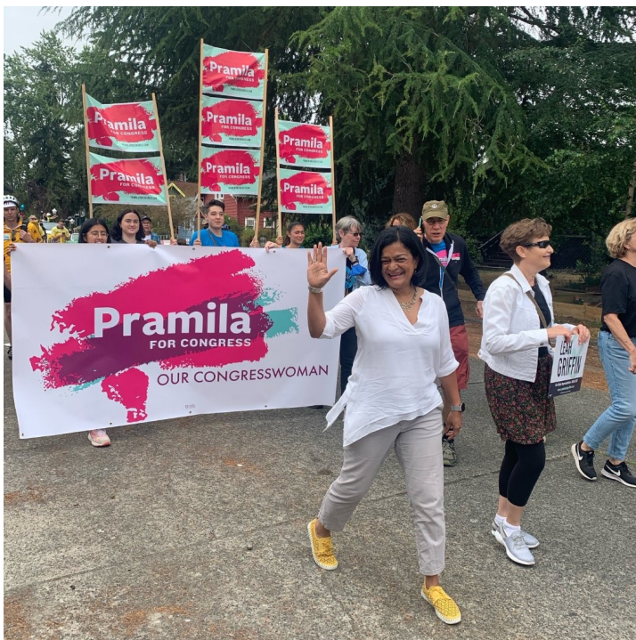
US Rep. Pramila Jayapal and her contingent joined us at the West Seattle Grand Parade on July 23.