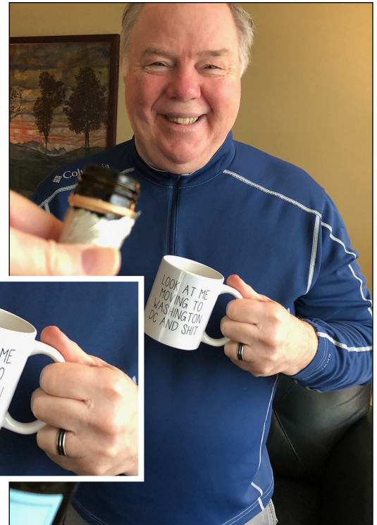
Max Vekich as he was confirmed by the Senate on February 10th.