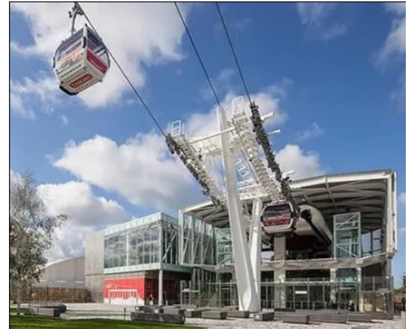
London's Emirates Air Line crosses the Thames.