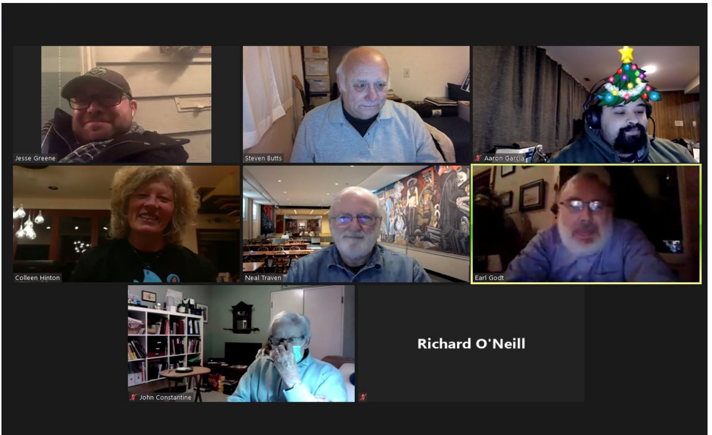
One of the “break out” Zoom rooms at our December Holiday Party. These small meeting spaces allowed for the semblance of the socializing that we would have normally enjoyed. Highline School Board Member entertained us with his many Zoom accouterments (Upper Right).